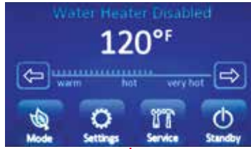
Start Up Screen